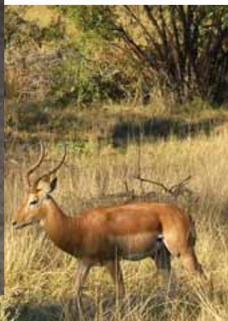
our guides were FABULOUS!