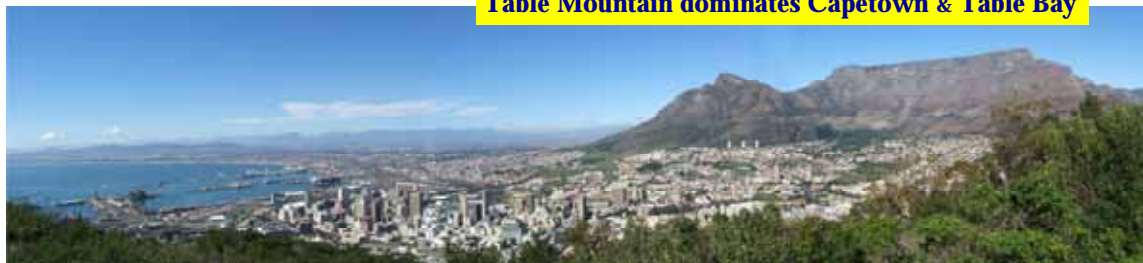
Table Mountain dominates Capetown & Table Bay