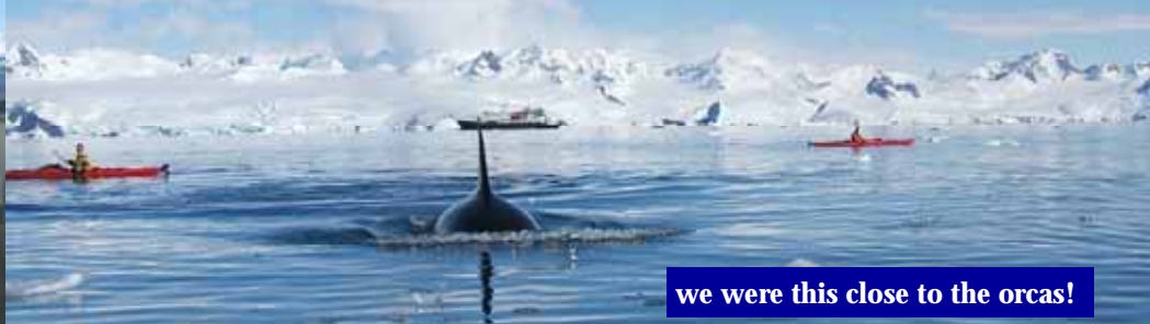
we were this close to the orcas!

We disembarked at Ushuaia January 27 and flew the same afternoon to Buenos Aires (BA) to begin the warm-weather sector of our adventure – it was analogous to being thrust from a blast freezer into a fan-forced oven! Although we did enjoy many of the sights of BA, it's not a destination I would recommend to anyone considering visiting Argentina – with the exception of a few imposing/unusual monuments, the city offers nothing of architectural merit, whilst the shopping/dining/historical attractions are largely unimpressive to anyone who has been to Paris, Rome, Madrid or any small Australian outback town! And don't even contemplate wasting an entire day + more than US$250 by crossing the filthy Rio de la Plata to Colonia del Sacramento! I'll