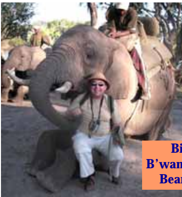
Big B'wana Bear!