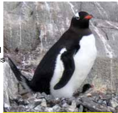
Gentoo penguin & new chick