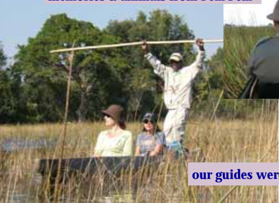
memories & animals from Pom Pom