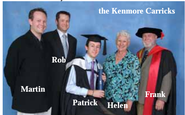
the Kenmore Carricks