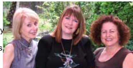
St Ursula's 'old' girls together at Coomera

his first close encounters with elephant, rhino, giraffe and zebra from open-sided safari vehicles. He was blown away by the sheer opulence of the Palace at Sun City (where they stayed and he played a round of golf) and really warmed to the black African people with whom he came into contact, particularly the safari guides. They packed a crowded schedule into five days and the Bear returned waxing eloquent about the whole experience and (finally) enlisted in our forthcoming family trip .....which brings me to the undisputed highlight of our year, The Carrick Africa Safari ,