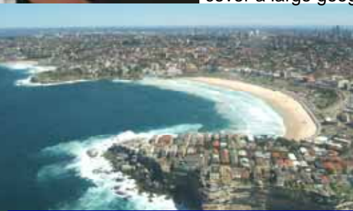
our view of Icebergs at Bondi from the DC-3