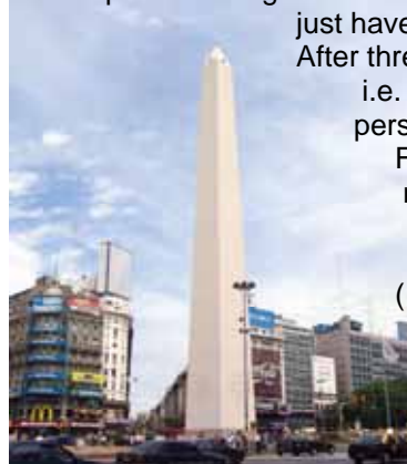
the Obelisco in Buenos Aires

From the commanding and always visible figure of Christ the Redeemer atop the towering granite monolith of Corcovado to the wide, golden beaches encircling most perimeters of the city, Rio de Janeiro is visually stunning – in fact, no amount of research or perusal of photographs really prepares one for the impact of Rio. Although we were not present for its most famous event ( Carnival is held in the lead-up to Easter), New Year's Eve is almost as well-attended and certainly as involving for the cariooca , who turn out in force and celebrate for more than twenty-fours non-stop, particularly on the beaches and specifically at Copacabana , where we were staying.