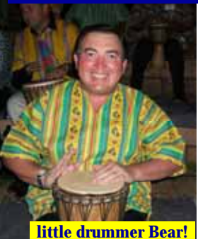
little drummer Bear!